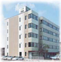
Kawanishi Holdings, inc.

Kawanishi Holdings, Inc. maximizes total group value and contributes to the development of health care and life science.